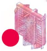
Full Height Turnstiles